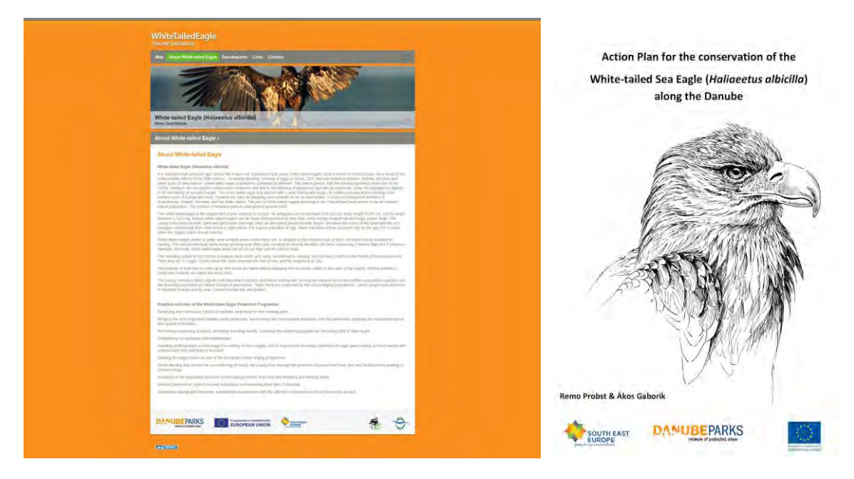
The International Database and the White-tailed Eagle Action Plan – two milestones for the future conservation activities for this species.

The conference in Illmitz 2007 has stressed the need of an International database. In the frame of the DANUBEPARKS network, the Duna-Drava National Park in cooperation with MME /BirdLife Hungary has established this database for South-East and Central Europe. Zsolt Nagy presented this tool and the actual status (e.g. more than 1400 breeding records are included so far). Many thanks to all data providers for their enthusiastic field work and for their cooperation! The speaker highlighted the intended purposes, presented the easy handling and invited all interested people to feed the database with their information. The online database can be found on <a href="http://whitetailedeagle.mme.hu/">http://whitetailedeagle.mme.hu/</a> and will be embedded in the DANUBEPARKS project website <a href="http://www.danubeparks.org">www.danubeparks.org</a> very soon.