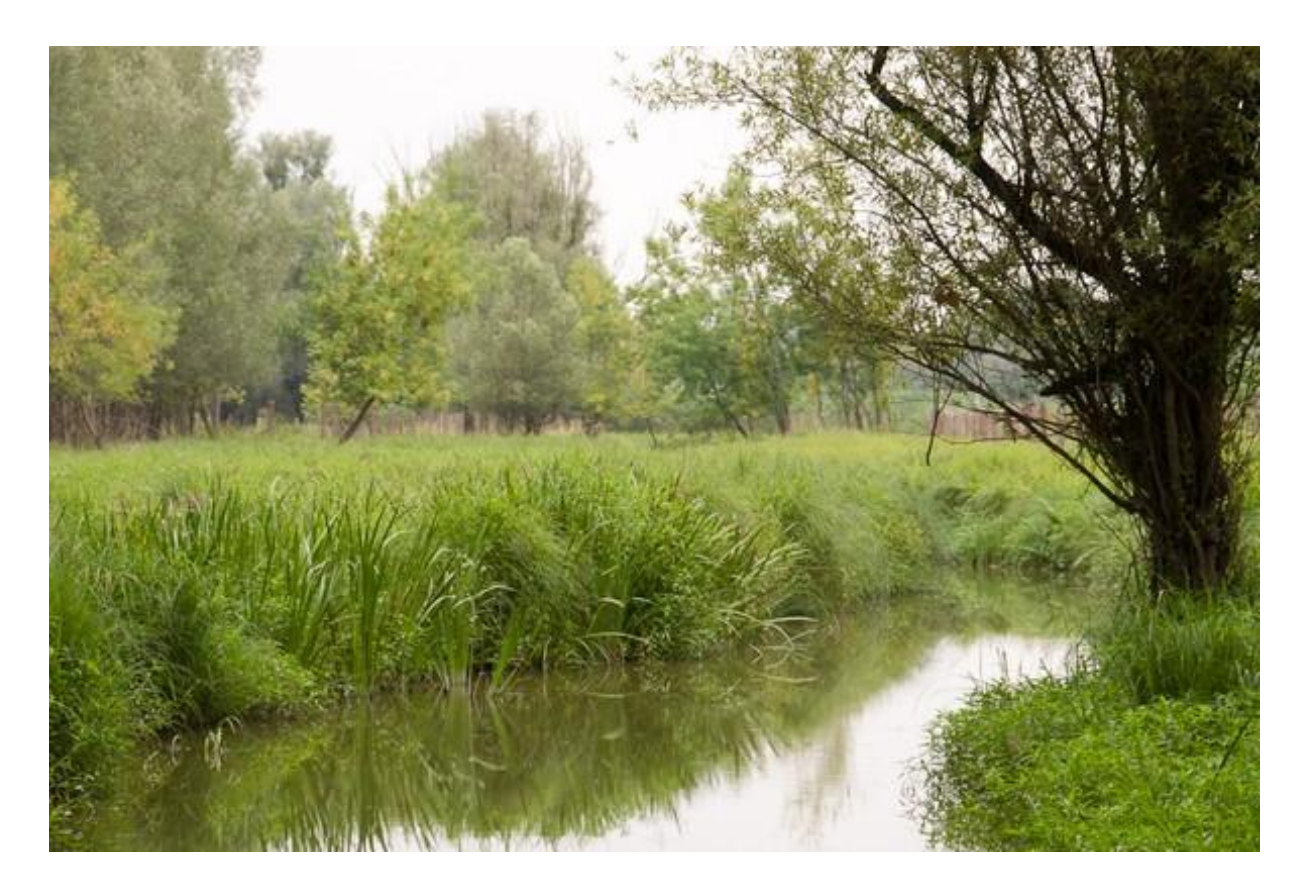
Beaver habitat in Gemenc, near Szekszárd-Keselyűs

Population keeps growing dynamically in most places, and according to WWf experts, "this growth will continue undisturbed, as there are more habitats for beavers especially along smaller streams" (WWF Hungary 2011). Thus the species is expected to show up in every part of the country (Bajomi, 2010).