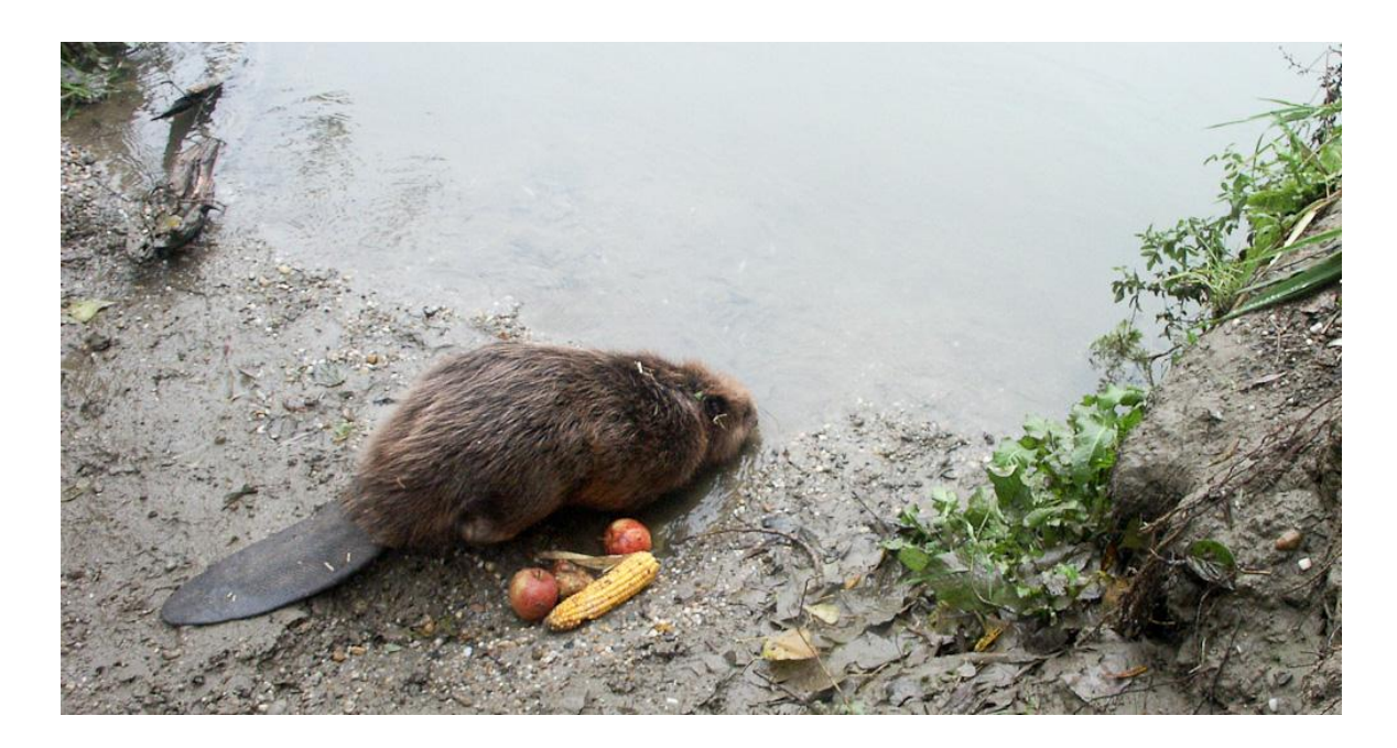
A newly released beaver reaching Drava in October 2007

The beavers were always released from the carriage boxes on the day of arrival. The releases with media publicity were hard releases, while at the rest of the releases the beavers were allowed more time to adapt. Some of the latter releases were hard, others soft. In some cases the cages were left open to set the beavers loose, then organisers returned for the empty cages. The beavers were not fed afterwards. During the reintroductions at Lake Tisza in 2005, at Mártély in 2006 and in Tiszatarján in 2008 organisers made artificial lodges, but the beavers did not use any of them. No control of predators or competitors was necessary in connection with the reintroductions (Márta Bera and Tamás Gruber pers. comm.).